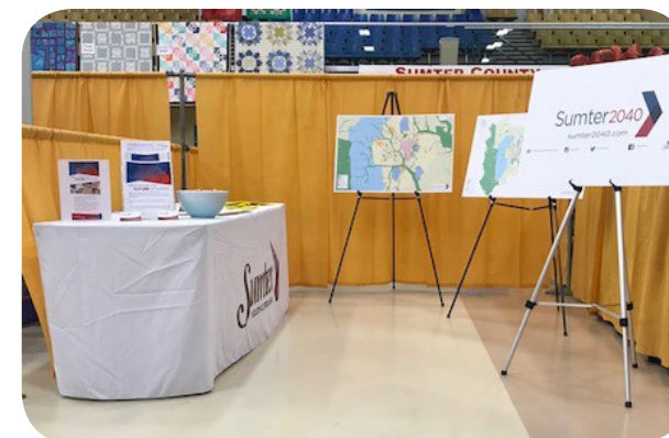
Photo: Display at Sumter County Fair